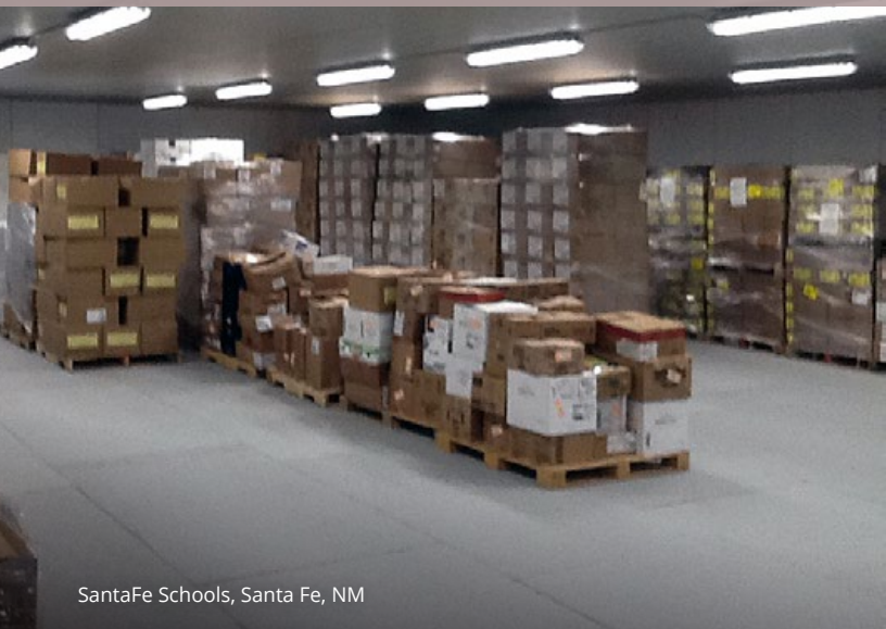
SantaFe Schools, Santa Fe, NM