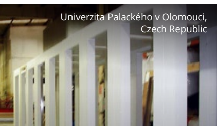
Univerzita Palackého v Olomouci, Czech Republic