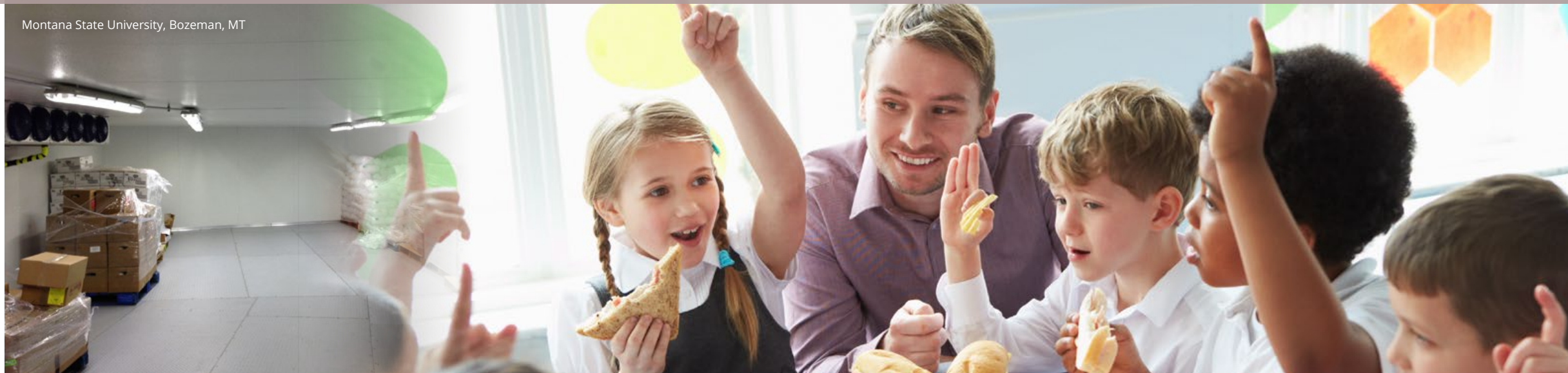
Montana State University, Bozeman, MT