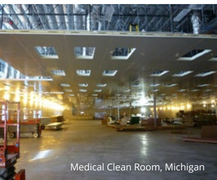
Medical Clean Room, Michigan